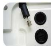
Double safety fuse