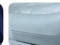
Pure TPU Air cells Independent chamber