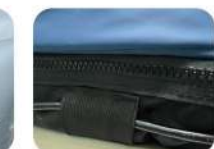
Elastic cable loop