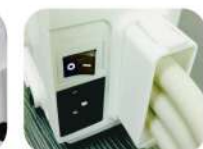
Quick release connector