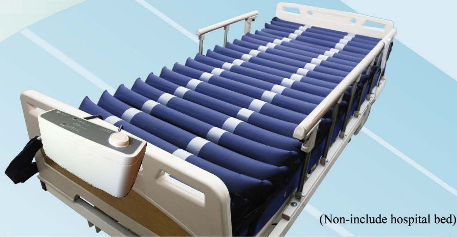
(Non-include hospital bed)

Long-term mobility impaired, long-term bedridden, spinal cord injured, disabled after stroke, paralyzed, unconscious in coma, incontinent, diabetic, patients or any patient who has delicate skin, weak physical strength or malnutrition can use the alternating air mattress & pump system to prevent and manage decubitus.