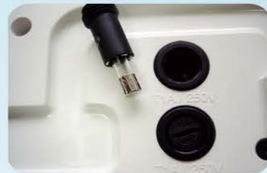
Dual External Fuse