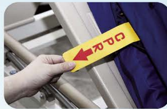
CPR Quick Deflation Valve