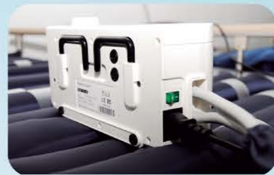
Safety Power Management