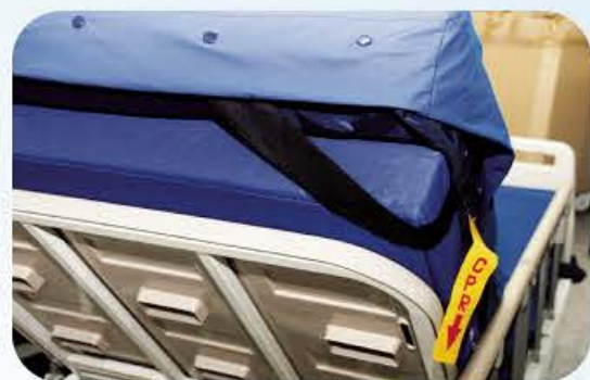
Wide Elastic Band for Mounting