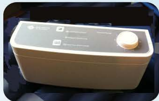
Digital Control Power Unit

Long-term mobility impaired, long-term bedridden, spinal cord injured, disabled after stroke, paralyzed, unconscious in coma, incontinent, diabetic, patients or any patient who has delicate skin, weak physical strength or malnutrition can use the alternating air mattress & pump system to prevent and manage decubitus.